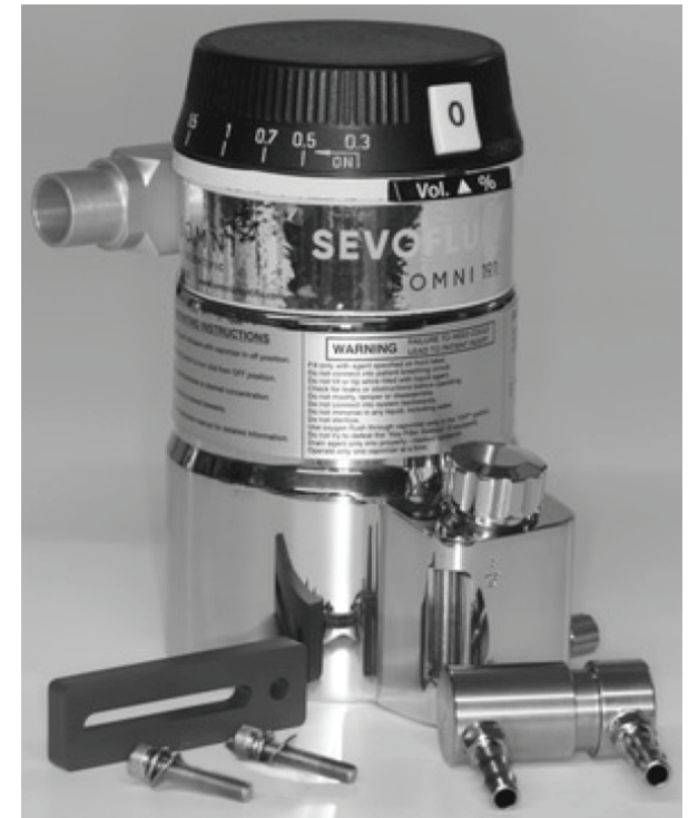
Vaporizer Spacer placement

Complete a 10 second pressure test to confirm a leak free installation. See next page